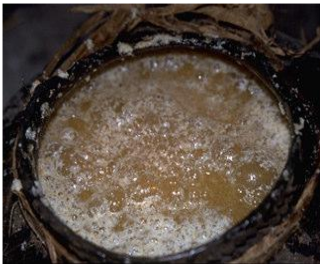
Figure 3. Vigorously fermenting mash of ogol , the traditional honey wine of Southwest Ethiopia.

After 1 night to 3 days, the fermented mash was ready to be drunk (Figure 3). It was strained to prepare the ogol . The residue composed of the bark and viable yeast cells was recycled to prepare bite for the next batch of ogol brewing. When recycled bark containing yeast cells was used, it took only 2 to 3 days to prepare the bite for the next batch.