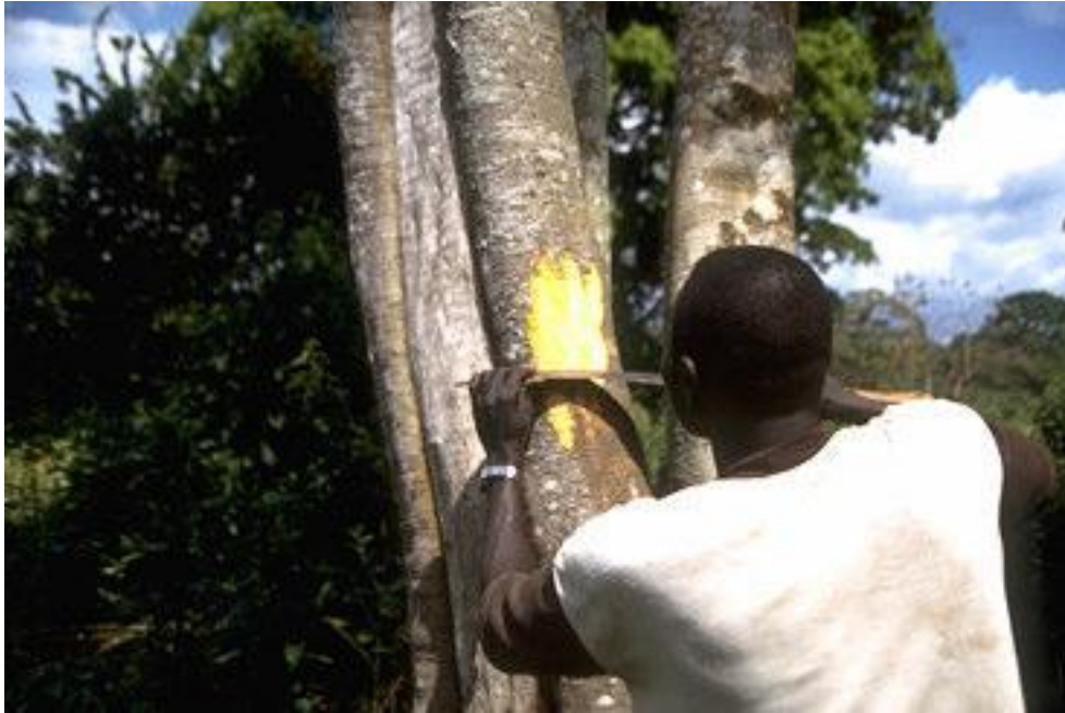
Figure 1. The bark of mange ( Blighia unijungata Bak) used for ogol brewing.