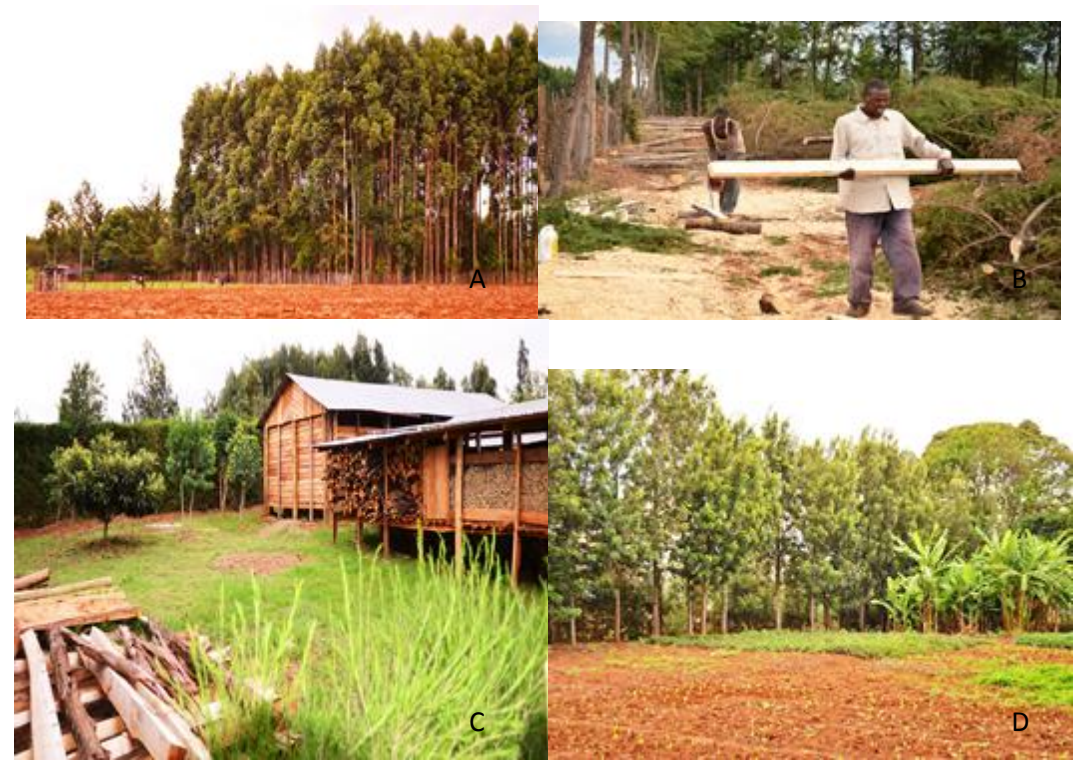
Figures III<sub>a</sub> to III<sub>d</sub>, Show some of the socio-economic benefits attributable to agroforestry In Kapsaret.

information influences the management, utilization, species preference and availability of trees on farms. Seventy-eight percent (78 %) of the respondents agreed that men and women play different roles in the community hence in different ways hinder the availability and utilization of agroforestry trees. Men, for instance, may wish to keep trees on their farms for timber and poles to support construction, while women may do the same for fuelwood. This becomes a challenge when it comes to management and harvesting due to conflicting interests between the genders.