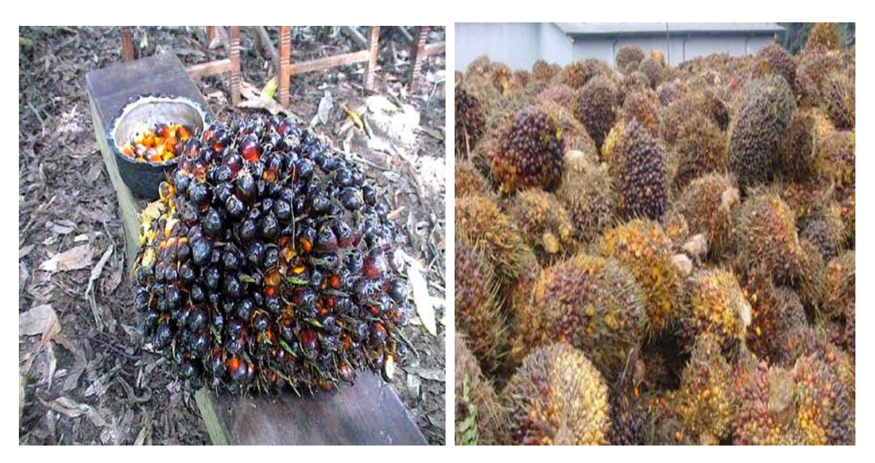
Figure 1. Fresh fruit bunches waiting for processing at palm oil mill.