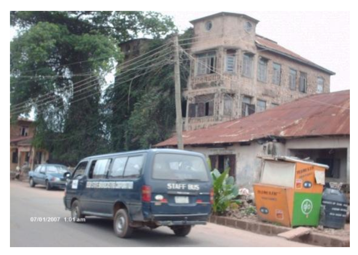
Figure 1. The urban core location of Sussan Wenger's building, Osogbo, Nigeria.

Southwestern zone of the country. Geographically, Osogbo is situated on Latitude 7°46' 0" North and Longitude 4° 34' 0" East. By road, Osogbo is 88 km South of Ilorin and 511 km Northwest of Akure.