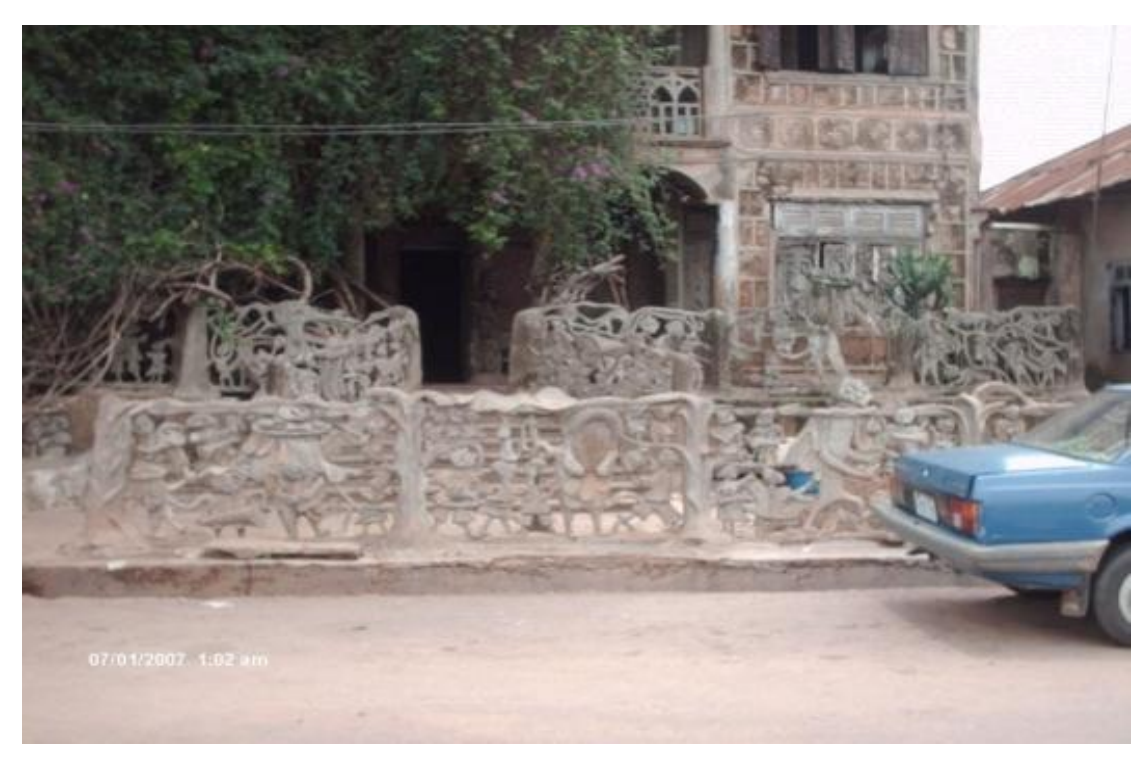
Figure 7. The artwork of the frontage fence of Sussan Wenger's building, Osogbo, Nigeria.

have cornices. The second floor in particular has timber jealousy louver windows with vent light.