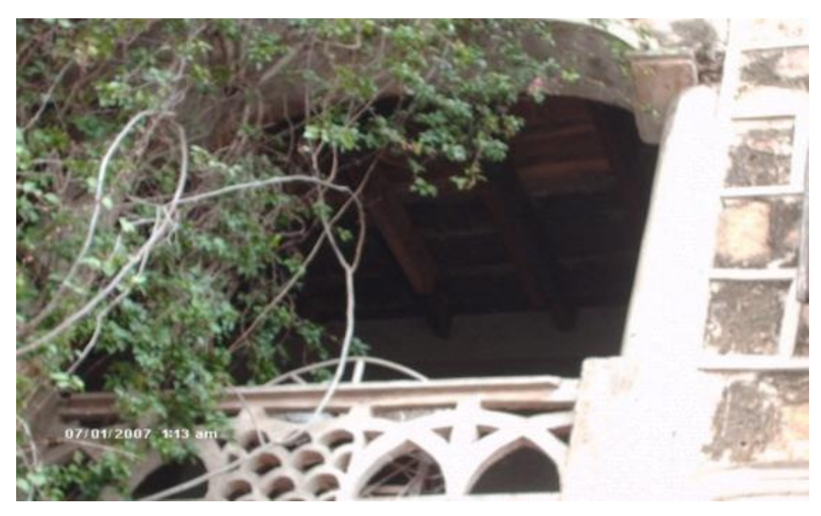
Figure 4. The timber second floor of segments of Wenger's building, Osogbo, Nigeria.