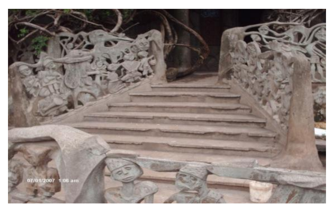
Figure 2. The approach entrance stair to Sussan Wenger's building, Osogbo, Nigeria.