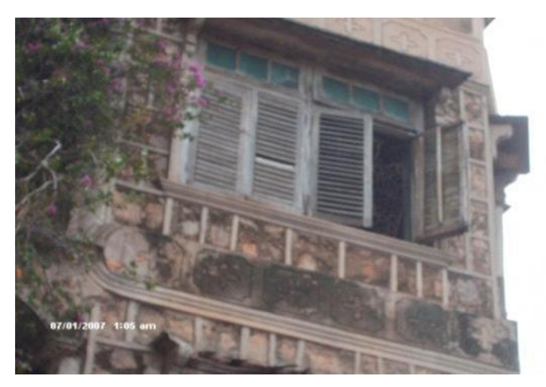
Figure 5. The stone rubble walls of Sussan Wenger's Building, Osogbo, Nigeria.

rubbles with high relief murals. The two towers have glazed circular vent lights. Majority of the building elements are exhibition of art works. The windows and