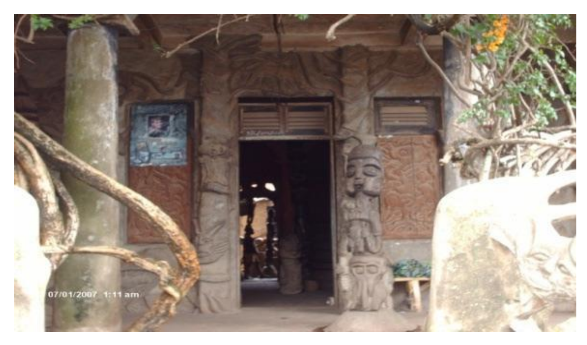
Figure 6. Carved windows and entrance door of Sussan Wenger's building, Osogbo, Nigeria.