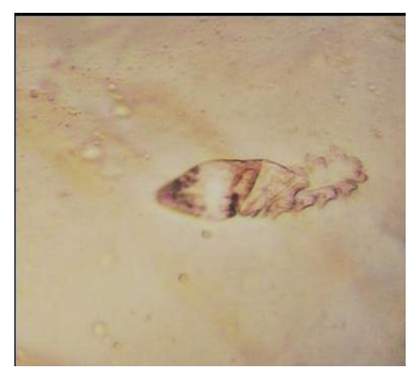
Figure 1. Adult Demodex spp. 100X.