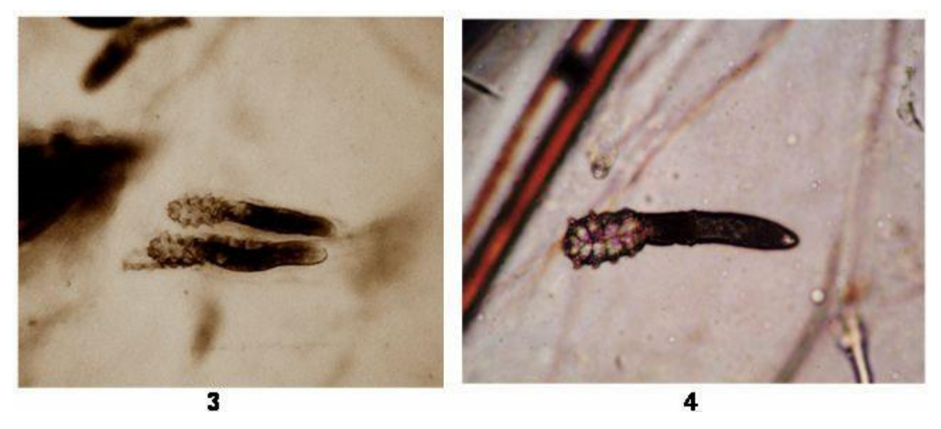
Figures 3 and 4. Adult Demodex spp. in specimens from face 100X.