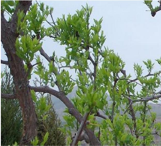
(a) Sprout-leaf development period