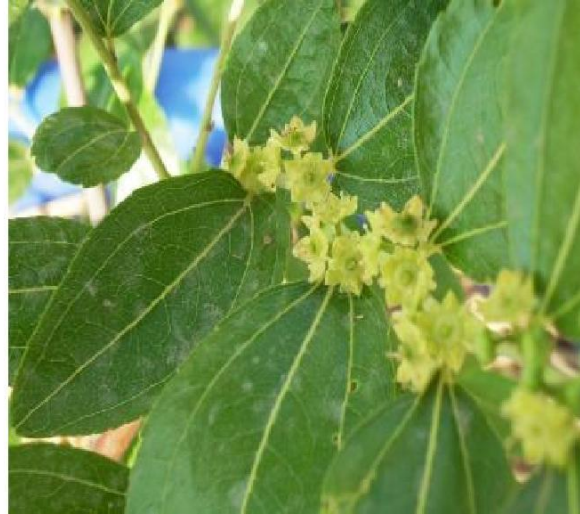
(b) Flowering and fruit-setting period