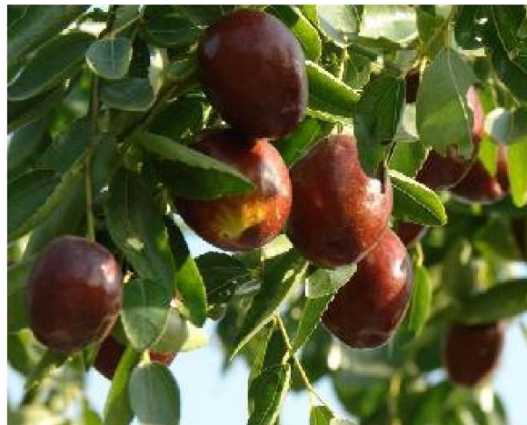
(d) Fruit mature period