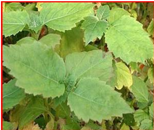
Figure 1. Pogostemon parviflorus Benth.

screening of medicinal plants for antimicrobial activities and phytochemicals is important in finding potential new compounds for therapeutic use. This paper reported the results of a survey that was done based on folk uses, by tribal people, with bioassay test for anti- Candida activity.