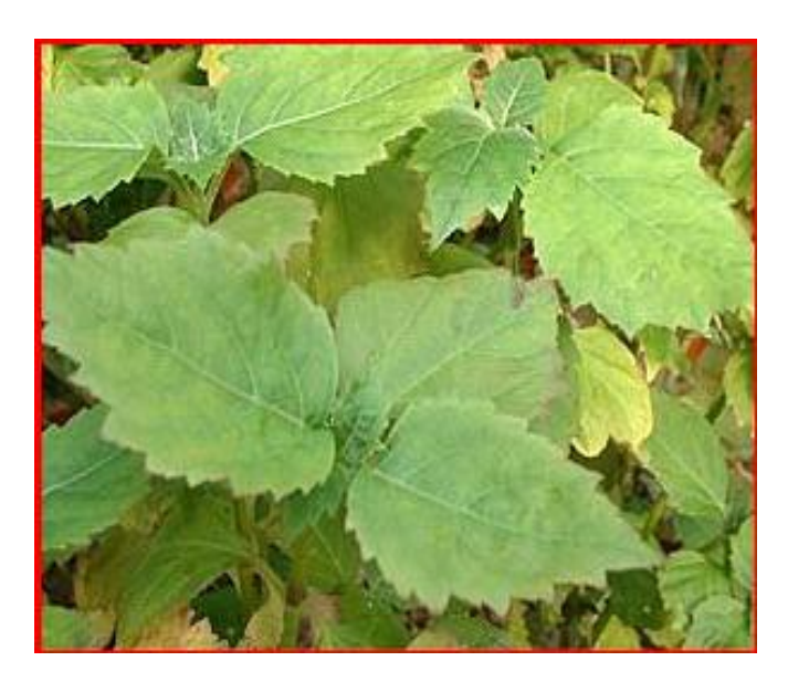
Figure 1. Pogostemon parviflorus Benth.

screening of medicinal plants for antimicrobial activities and phytochemicals is important in finding potential new compounds for therapeutic use. This paper reported the results of a survey that was done based on folk uses, by tribal people, with bioassay test for anti-Candida activity.