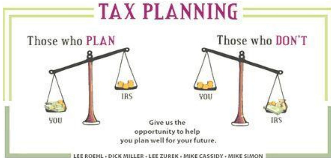
Figure 1. Tax planning.