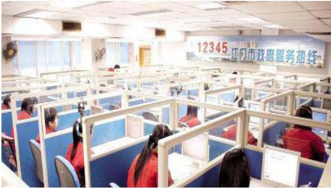
Figure 2. The working station of the “12345” service hotline center of Jiangmen city.

As a comprehensive service platform and an important way to satisfy the public demand, the “12345” service hotline had extended its influence sphere to various departments and districts. The public can dial “12345” at any time and the call will be directed to the service hotline center. Thus, it prompted the public to put forward their opinions about the city development and facilitated the provision of public service. The “12345” service hotline ensures the opinions, proposals and demands of the public entering a rigorous process of record, supervision, coordination, answer, tracing, feedback, examination, responsibility investigation and so on. So, the problems from the public can be solved as soon as possible or a satisfactory reply is given. For those that cannot be solved in a given time span or those that have not obtained satisfactory answer, the hotline center will report them to the leaders of the relevant departments and make sure the complaints were solved effectively. For repeated complaints and unsolved problems, the city leaders will review the matter and hold a meeting to find a satisfactory solution to the problems.