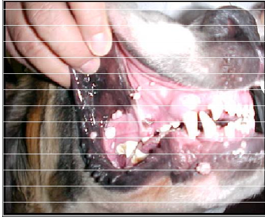
Figure 1. Multiple oral wart-like lesions on the oral mucosa from male dog.