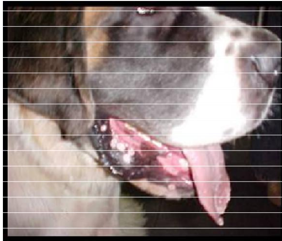
Figure 2. Small oral papillomas on the tongue and around of the oral cavity from dog.