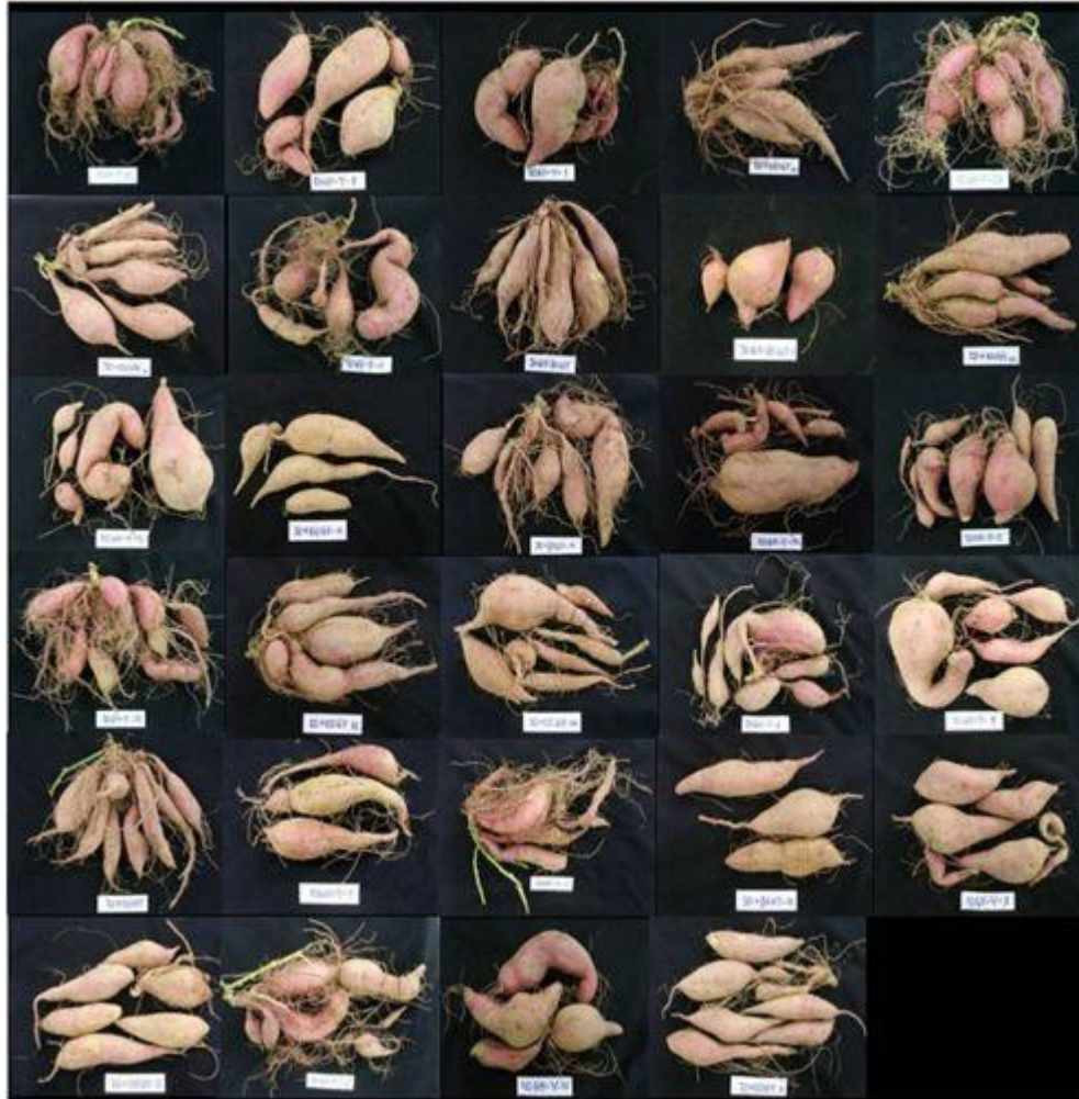
Figure 2. Twenty nine selected mutant lines based on the yield potential, seed color and other characteristics. These putative mutant lines were selected from 600 lines.

combination of chronic gamma irradiation and tissue culture is a well-established means of inducing mutants (Nagatomi et al., 1996, 2000; Wang et al., 2007), and enhances mutation frequency, which increases the types of mutations that arise (Nagatomi et al., 2000).