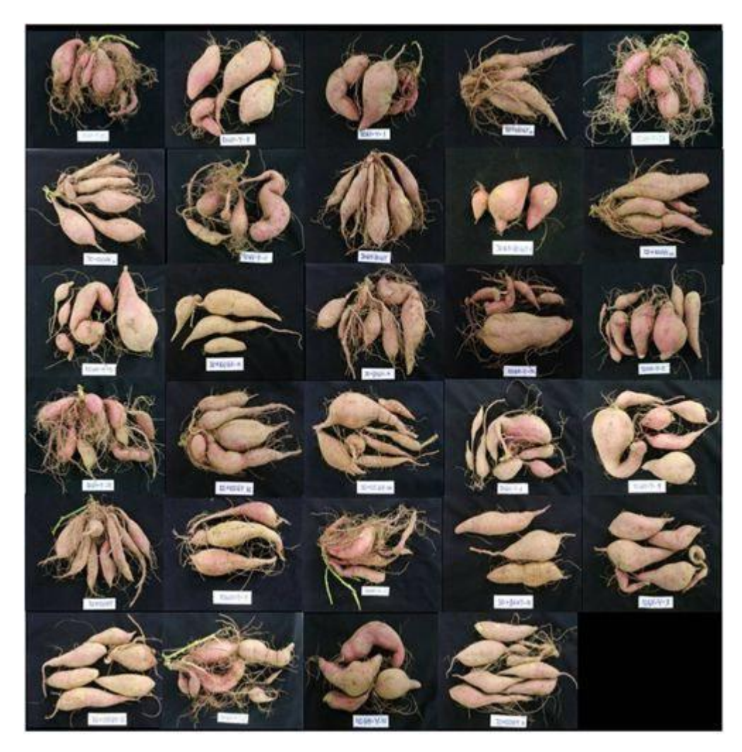
Figure 2. Twenty nine selected mutant lines based on the yield potential, seed color and other characteristics. These putative mutant lines were selected from 600 lines.

combination of chronic gamma irradiation and tissue culture is a well-established means of inducing mutants (Nagatomi et al., 1996, 2000; Wang et al., 2007), and enhances mutation frequency, which increases the types of mutations that arise (Nagatomi et al., 2000).