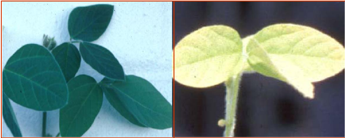
Figure 1. Differences in leaf color indicating differences in N 2 -fixation effectiveness among early juvenile soybean plants grown in nitrogen-free medium inoculated with a cowpea type rhizobial strain IV.