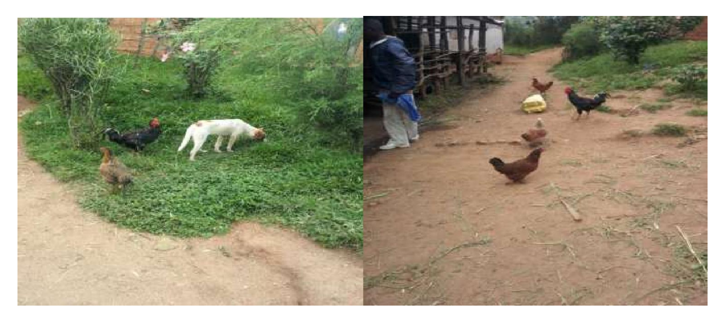
Figure 2. Indigenous chicken scavenging for feeds on free range system in Nyanza District (Source: During data collection).

Crossing breeding of local chicken with high performing improved/pure breed has been proven to have positive effects by increasing the overall meat and egg production (Pedersen and Kristensen 2002). However, only, 5.3% of the respondents reported to have adopted this technology. There by the vast number (94.7%) of households reared, local, less productive chickens. New born chicks, eggs and cocks of improved (synthetic genotypes suited for multipurpose production under the Kenyan environment is also available to the farming community). In Rwanda therefore, low cost poultry farmers especially women should be encouraged to rear improved village chicken types such as. Kuroiler, in large flocks. The use of protective chick confinement structures such as brooding baskets will be valuable in ensuring flock growth by reducing chick mortality.