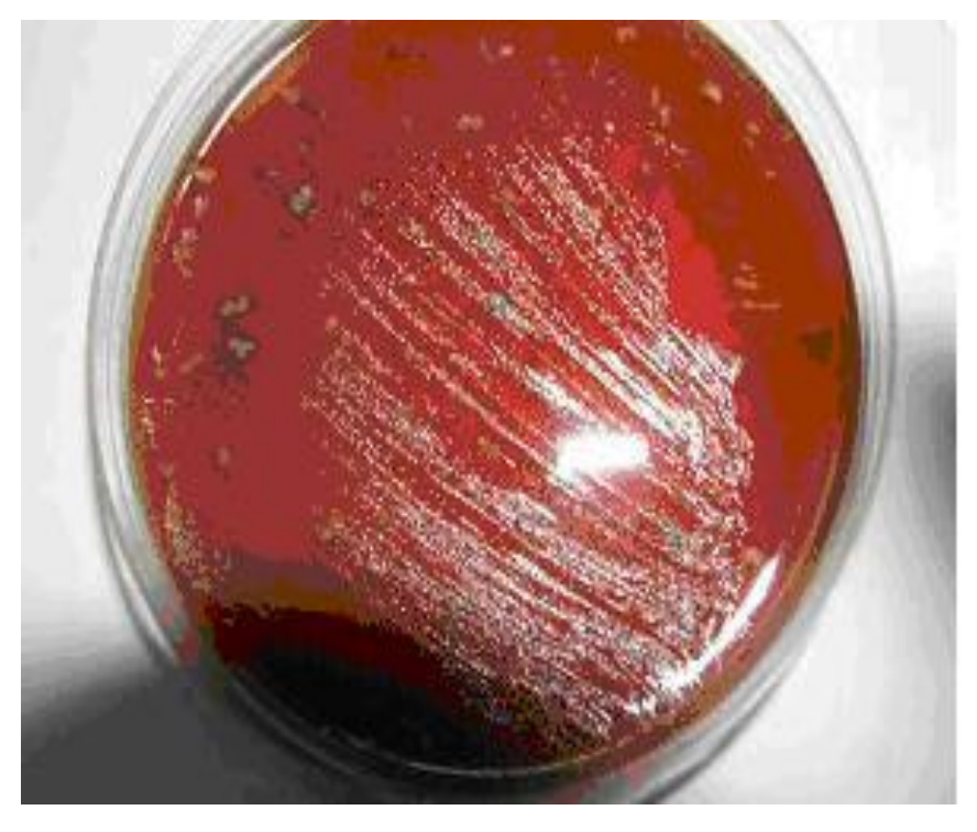
Figure 3. Hydrogen peroxide production by Lactobacillus acidophilus (blue colonies indicate colonies capable of producing hydrogen peroxide).

Table 1. pH of vaginal discharge from pregnant women.