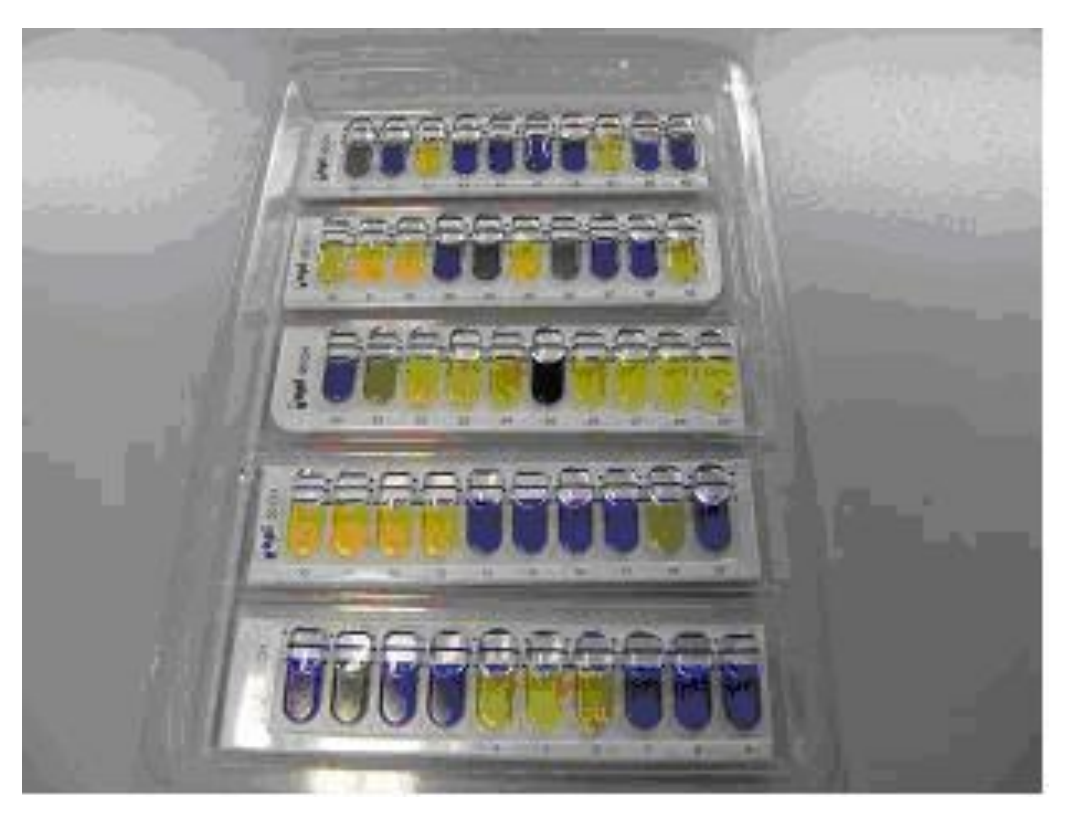
Figure 2. Color reaction of Lactobacillus acidophilus on the API50 CHL Lactobacillus identification kit.

pure Lactobacillus strains after isolation were directly inoculated into MRS culture medium supplemented with 0.25 mg/ml of tetramethylbenzidine (TMB) and 0.01 mg/ml horseradish peroxidase (HRP), placed in an anaerobic incubator, and cultured at 37°C for 48 h. Then, the culture medium was removed, and bacteria were exposed to the aerobic environment for 30 min. Lactobacillus (LB +) colonies producing hydrogen peroxide would develop a blue color in that the hydrogen peroxide generated by Lactobacilli would be decomposed by peroxidase to generate oxygen, which, in turn, would oxidize TMB to form a blue adduct (Figure 3).