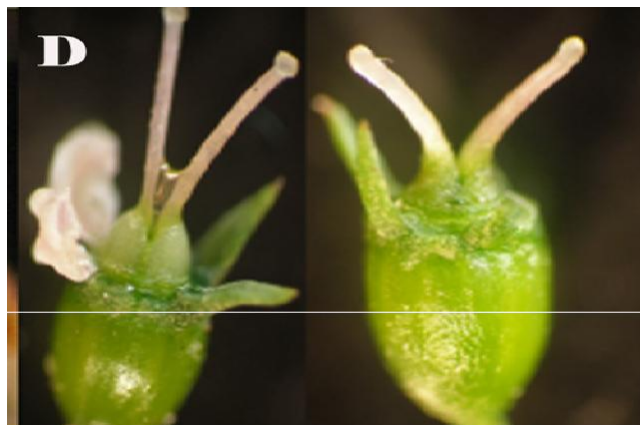
Figure D. Pistil of Normal floret (Left) and Maleic Hydrazide affected floret (Right).