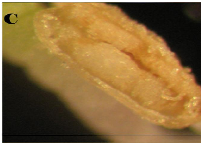
Figure C. Pollen agglutination in anthers affected by Maleic Hydrazide.