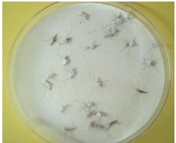
Figure 2. B. bassiana RBL1034 growing on mosquito cadavers 3 days after death following exposure to fungus impregnated target.

The main objective of malaria vector control is to break the transmission of malaria parasite. Therefore reducing the life span of the female A. gambiae will have a considerable impact on the transmission risk of the malaria parasite. Sholte et al. (2003) reported that an entomopathogenic fungus Metarhizium anisopliae was pathogenic to both sexes of A. gambiae and Culex quinquefasciatus and mosquitoes in the treated group died significantly earlier than those in the control group. Similarly, in the