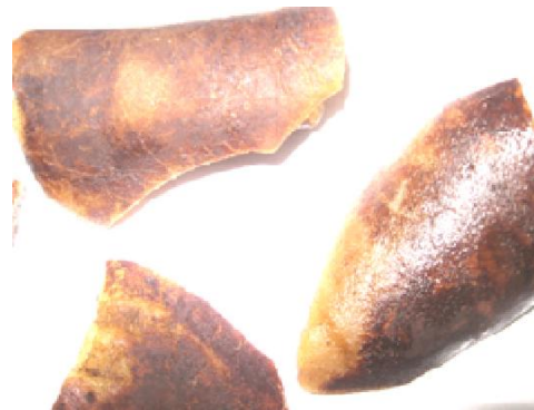
Figure 2. Finished product, ponmo obtained by burning off hair with flame (observe the dark colouration from burning).

ked flame. The corresponding values for cowhides processed by other methods are presented in Table 2 under the subheading 'before boiling' for those cowhide samples that were treated with flame. The samples were scraped to remove ash and boiled for about one hour. The metal concentrations in the boiled samples are presented under the subheading 'after boiling'. Cowhide samples which were purchased from the open market had already been processed by any of the four methods discussed but not known to the buyers.