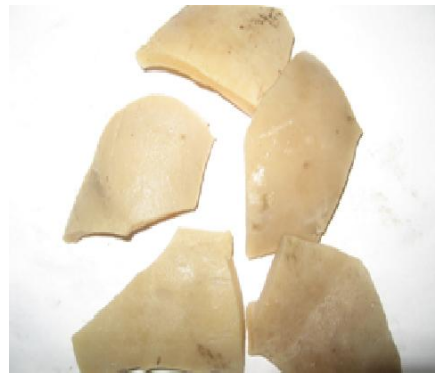
Figure 1 Finished product ponmo, obtained by the traditional method of boiling in water followed by shaving.

Figure 1 shows the finished product 'ponmo' processed by the traditional method of boiling in water followed by shaving. Figure 2 shows the finished product 'ponmo' obtained by singeing off the hair with flame. The dark colouration usually obtained is due to burning. The results of the concentrations of the metals determined in the cowhides obtained by the traditional method of boiling the hides are presented in Table 1. It should be noted that the cowhides thus treated were not exposed to na-