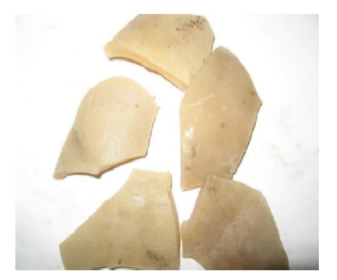
Figure 1 Finished product ponmo, obtained by the traditional method of boiling in water followed by shaving.

Figure 1 shows the finished product ' ponmo ' processed by the traditional method of boiling in water followed by shaving. Figure 2 shows the finished product ' ponmo ' obtained by singeing off the hair with flame. The dark colouration usually obtained is due to burning. The results of the concentrations of the metals determined in the cowhides obtained by the traditional method of boiling the hides are presented in Table 1. It should be noted that the cowhides thus treated were not exposed to na-