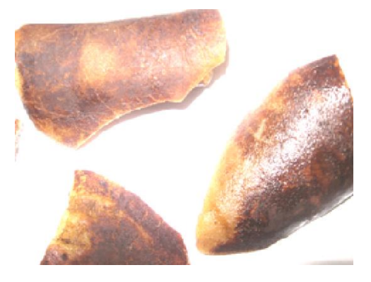
Figure 2. Finished product, ponmo obtained by burning off hair with flame (observe the dark colouration from burning).

ked flame. The corresponding values for cowhides processed by other methods are presented in Table 2 under the subheading 'before boiling' for those cowhide samples that were treated with flame. The samples were scraped to remove ash and boiled for about one hour. The metal concentrations in the boiled samples are presented under the subheading 'after boiling'. Cowhide samples which were purchased from the open market had already been processed by any of the four methods discussed but not known to the buyers.