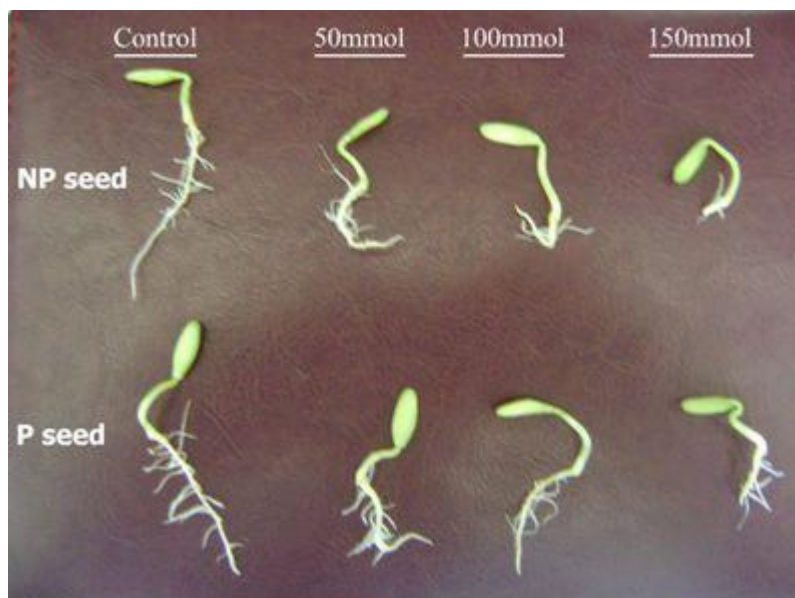
Figure 3. Effect of salt stress and seed priming on seed germination of cultivar Flexuosus.