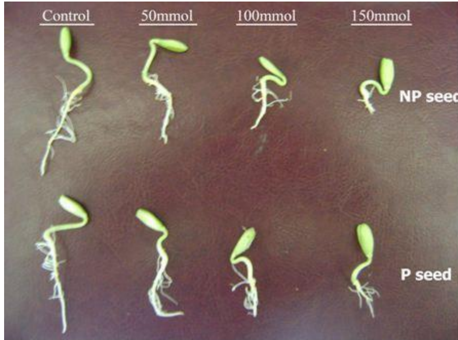
Figure 4. Effect of salt stress and seed priming on seed germination of cultivar Garmsar.

and environment friendly ways. Seed priming is one of such type of methods and NaCl priming has shown improved germination and growth of many crops under stressed conditions (Sivritepe et al., 2003; Farhoudi et al., 2007; Shahi et al., 2009; Cayuela et al., 1996). Results show that salt stress caused growth inhibition and increase in mean germination time of muskmelon cultivars. Priming decreased mean germination time and increased muskmelon seedling emergence and seedling dry weight in saline conditions compared to non priming, especially in cv. Garmsar (Table 1). These results indicated that, seed priming may be helpful in reducing the risk of poor stand establishment, under stress condition and permit more uniform seedling growth under saline condition (Figures 1 and 2). Priming with NaCl also showed improvement in growth of melon seedling (Sivritepe et al., 2003) when salt treatments were applied with seed sowing. Khan et al. (2009) reported that, NaCl priming was much efficient in improving germination and seedling growth of pepper seeds and our results also confirmed it. In earlier studies, it was observed that seedlings from NaCl primed canola seeds maintained greater mean seedling dry weights and cell membrane stability than untreated seedlings (Farhoudi et al., 2007). Salt stress decreased shoot dry weight of muskmelon cultivars and led to substantial reduction in leaf proline, sugar content and CAT activity (Table 2).