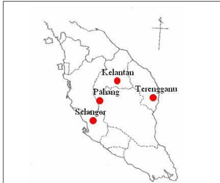
Figure 1. Map of Peninsular Malaysia showing the infected areas i.e. Selangor, Pahang, Terengganu and Terengganu (Sijam et al., 2008).