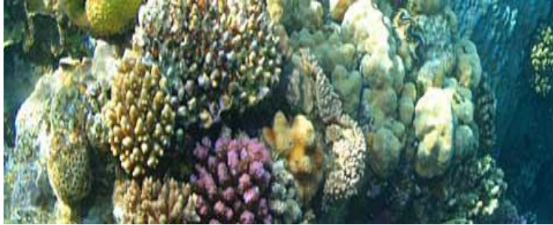
Figure 1. Red sea marine hábitat.