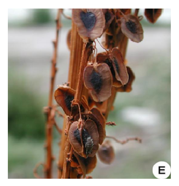
Figure 1e. Morphology of Rheum tanguticum ; Fruits.

closely related to R. palmatum and R. officinale . However, we found in the field survey that the differences among these three species are morphologically interwoven. The results of the anatomical studies also indicated that the three species are similar and can not be distinguished from one another (Li and Zhang, 1983).