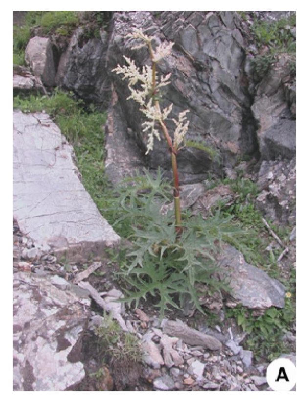
Figure 1a. Morphology of Rheum tanguticum ; Plant and microhabitat.