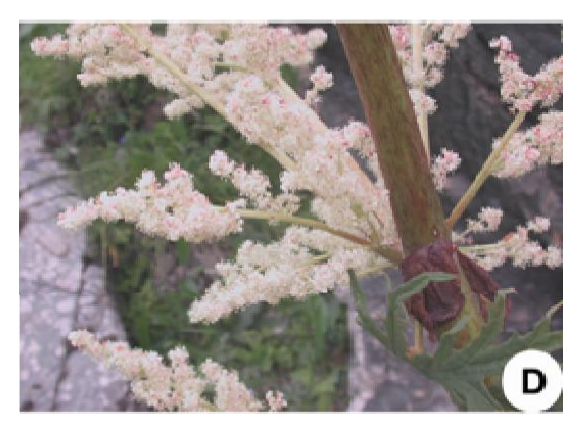
Figure 1d. Morphology of Rheum tanguticum ; Branches of inflorescence.

scent. Leaves are basal and cauline. Basal leaves are orbicular or broadly ovate, large, 30 - 60 cm long, abaxially pubescent, adaxially papilliferous or muricate, basal veins 5, base subcordate, deeply palmately 5-lobed, middle 3 lobes pinnatisect, apex narrowly acute (Figure 1c). Stem leaves are few and smaller than the basal ones. Ocrea are large, membrane, entire and brown. Panicle is large (Figure 1d). The flowers are small and bisexual. The pedicels are articulate. The tepals are six, white, purple-red, rarely light red, orbicular. The stamens are 9. The ovary is broadly ovoid, 1-locular and 1- ovule. The styles are three, horizontal in axis. The stigmas are inflated and recurved. The fruits are oblong-ovoid to oblong, 8 - 9.5