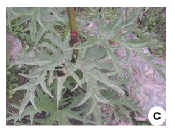
Figure 1c. Morphology of Rheum tanguticum; Leaves.

dark brown outside and yellow or red-yellow inside in color (Figure 1b). The rhizomes are shortened and erect. The stem is stout, hollow, finely sulcate, glabrous or pube-