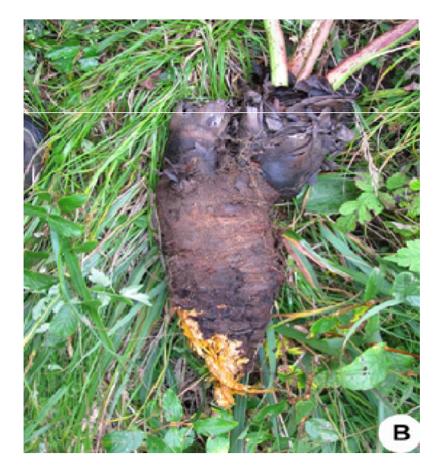
Figure 1b. Morphology of Rheum tanguticum; Root.

dark brown outside and yellow or red-yellow inside in color (Figure 1b). The rhizomes are shortened and erect. The stem is stout, hollow, finely sulcate, glabrous or pube-