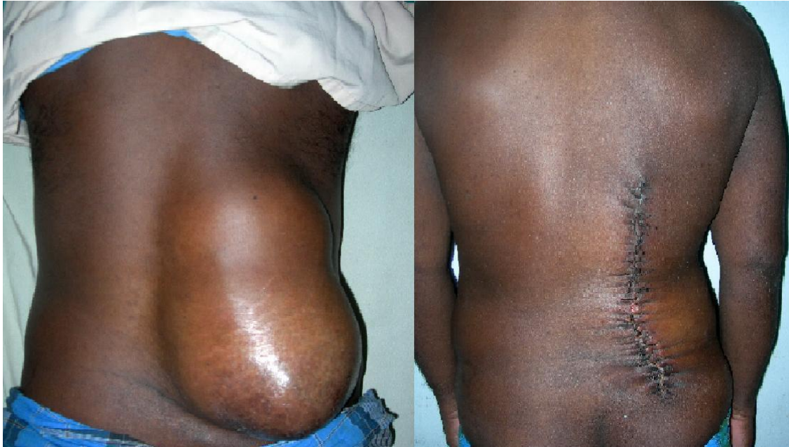
Figure 1. Distended veins and the overlying skin which was stretched and shiny.