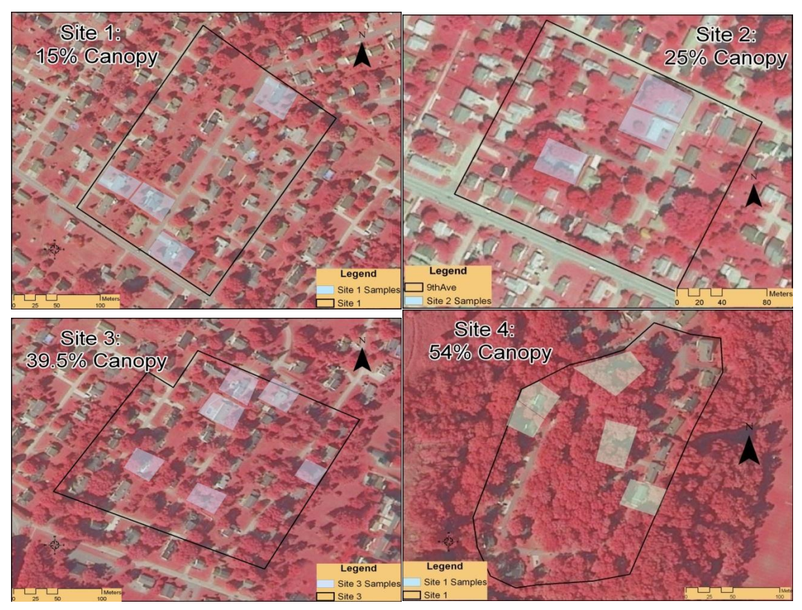
Figure 1. Color Infrared imagery of the four sites . Areas highlighted in gray were not sampled as permission was not given to enter the property.