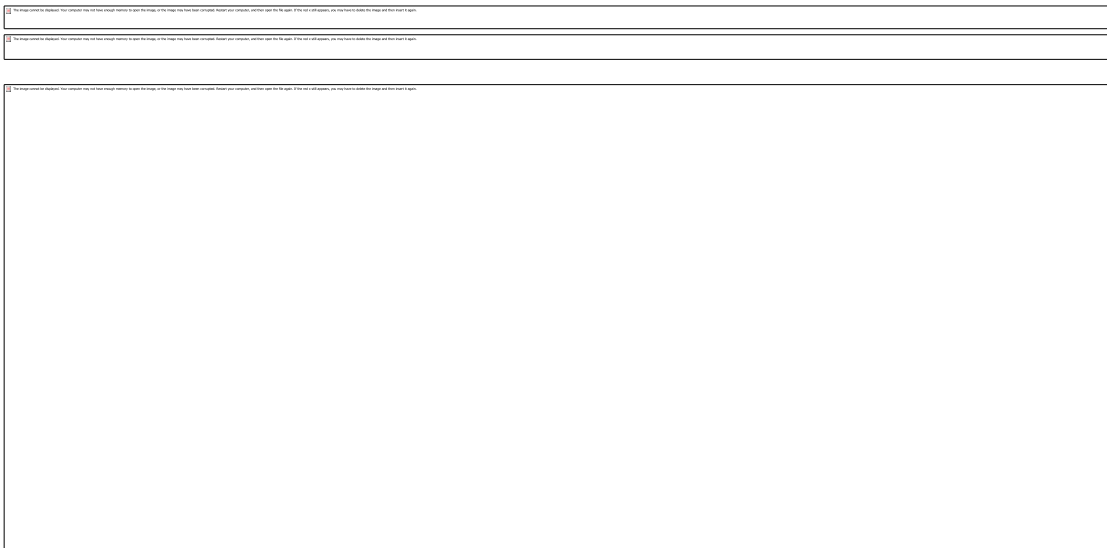
Figure 1. Mean percentages of correct responses for all students (S1, S2, S3, S4, & S5) across the video-based and traditional lectures during the baseline, intervention and follow-up conditions.

during intervention and follow-up conditions demonstrating that video-based lectures were at least as equally effective as standard teaching lectures. Nevertheless, average performances of all students demonstrated a slight superiority of video-based lectures over traditional ones.