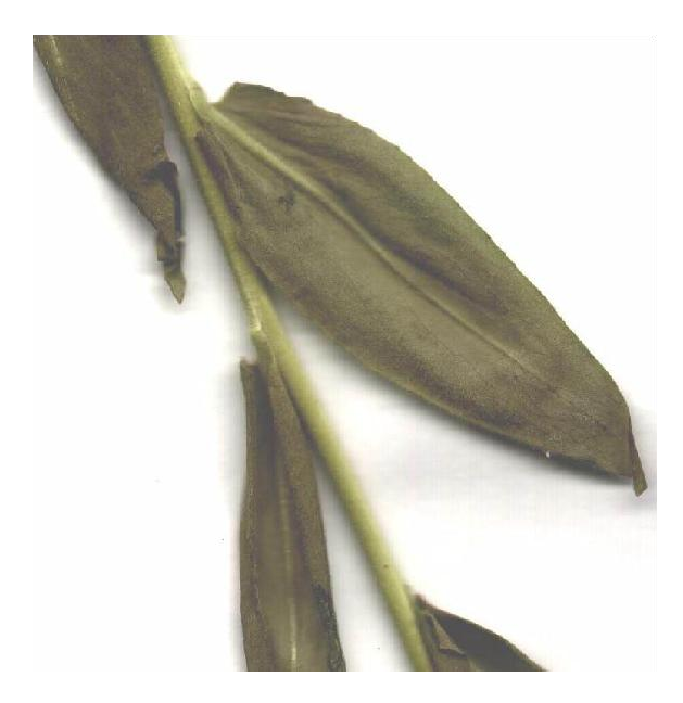
Figure 1. Detail of middle leaves (Costache 2005).