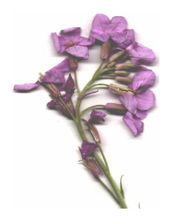
Figure 2. Detail of inflorescence (Costache 2005).

In 2004, from Romania, Hésperis pýcnotricha species was first identified in Gura Motrului locality, Mehedinti District, Oltenia Region (Costache, 2005; Ciocârlan and Costache, 2006). Subsequently, the plant has been identified in other locations: Cerna (Valcea District) in the edge of abandoned farms and its premises; Ponoarele (Mehedinti District) in some local households.