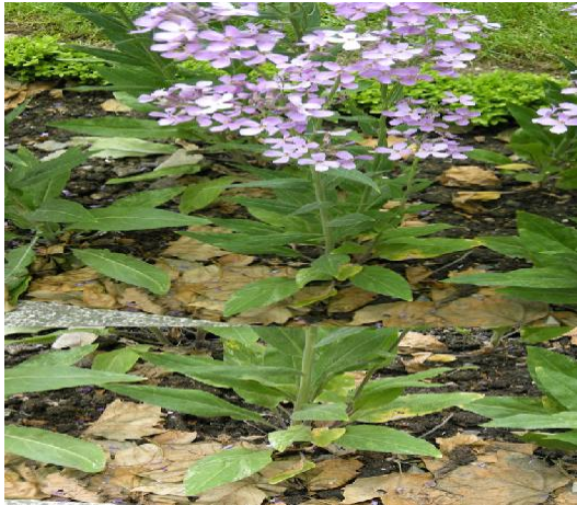
Figure 5. Habitus and detail basal leaves (Original, inside the yard of Dolmabahçe Palace, 24. 05. 2010).