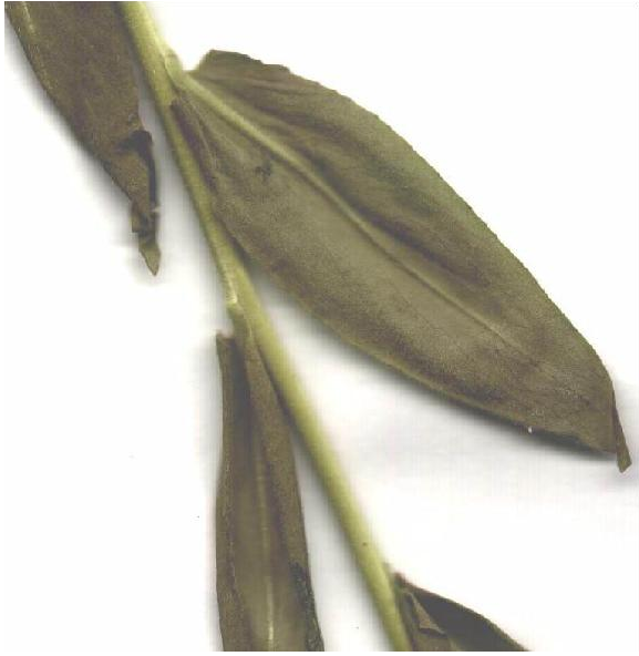
Figure 1. Detail of middle leaves (Costache 2005).