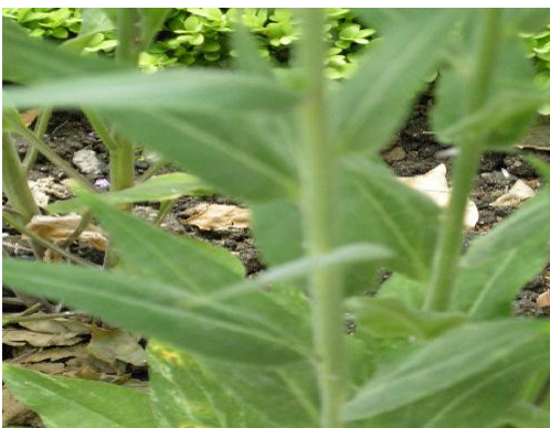
Figure 6. Detail of middle leaves (Original, inside the yard of Dolmabahçe Palace, 24. 05. 2010).