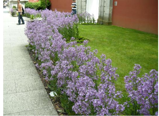
Figure 7. Picture with Hesperis pycnotricha (Original, inside the yard of Dolmabahçe Palace, 24. 05. 2010).