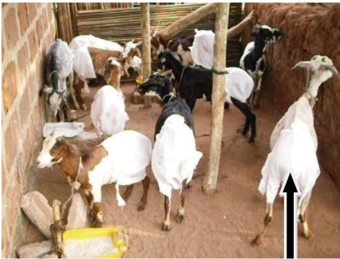
Figure 1. Morning faeces recovery device (diaper) from animals.

plants are being checked. This study aims at evaluating the efficacy of an aqueous extract of the leaves of Chenopodium ambrosioides against strongyle infection in West African Long Legged (WALL) goats. The plant is common in many parts of the world like Europe, Asia and Africa. It is used as medicinal herb (Quinlan et al., 2002; Ruffa et al., 2002; Efferth et al., 2002; MacDonald et al., 2004; Patricio et al., 2008). It is well known in rural areas of Benin as “trouzouman” (in “fongbé”, a national language) where it is deemed effective against some human parasitic diseases such as pinworms, tapeworms, roundworms and hookworms.