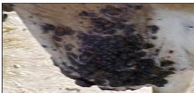
Figure 2. Macroscopic view of male bovine tumors with different morphologies before the initial treatment, presenting cauliflower aspect with dark color and another intermediate neoformations.