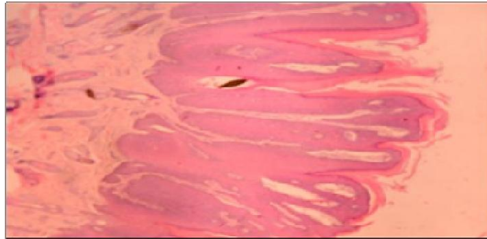
Figure 6. After 30 days vaccine treatment, the regularity of the disposition of the dermic papillae were observed as well as their height and thickness evidencing a situation close to normality. Obj.40x. H&E.

process of lesion regression began, developing into the detachment of the papillomas, confirmed histologically by moderate kariolisis, progressive degeneration of the verrucous tissue and formation of the epithelial tissue close to normality (figure 5 and 6). Among the 16 animals which were not vaccinated, regression and/or alterations of the cytomorphologic characteristics of the papillomas were not observed in the experiment.