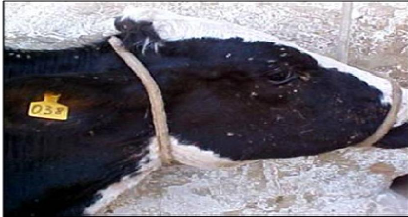
Figure 3. Contention of the same male bovine for vaccine treatment, surgical extraction of verrucous lesions for histopathology analysis to compare the regression with the clinical observation.