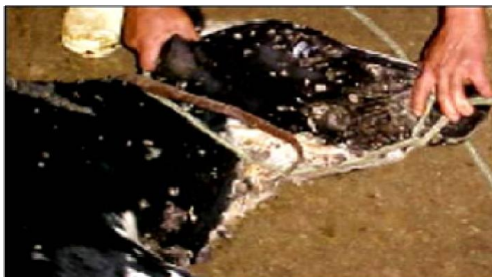
Figure 1. Bovine bearer of cutaneous papillomatosis with exophytic tumors located preferentially in the anatomic region of the head, neck, around the eyes and snout before autogenous vaccine treatment.