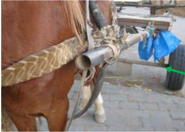
Figure 1. Shaft of charette.