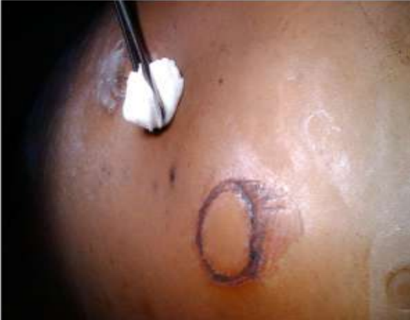
Figure 5. Circular bruise; case N°2

of the cases (Le Buquet, 1997; Flamming, 1997; Paillet, 1990). Their care must start early. Besides 30% of the ruptures of hollow organs are unknown and operated late (Barth et al., 2001) and the risk of mortality increases if the intervention is made beyond the 8 th hour (Allen et al., 1998). This hypothesis is in perfect harmony with our observations.