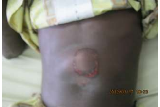
Figure 2. Superficial circular ulceration; case N°1