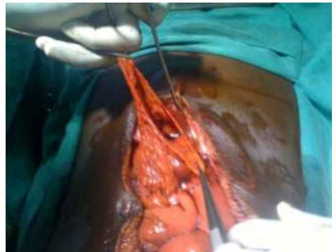
Figure 4. Preoperative image showing the duodenal wound