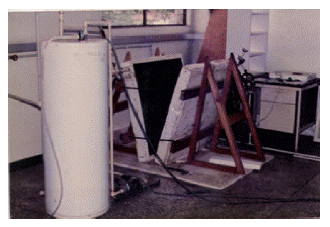
Figure 2. Steady state cold/hot plate apparatus.