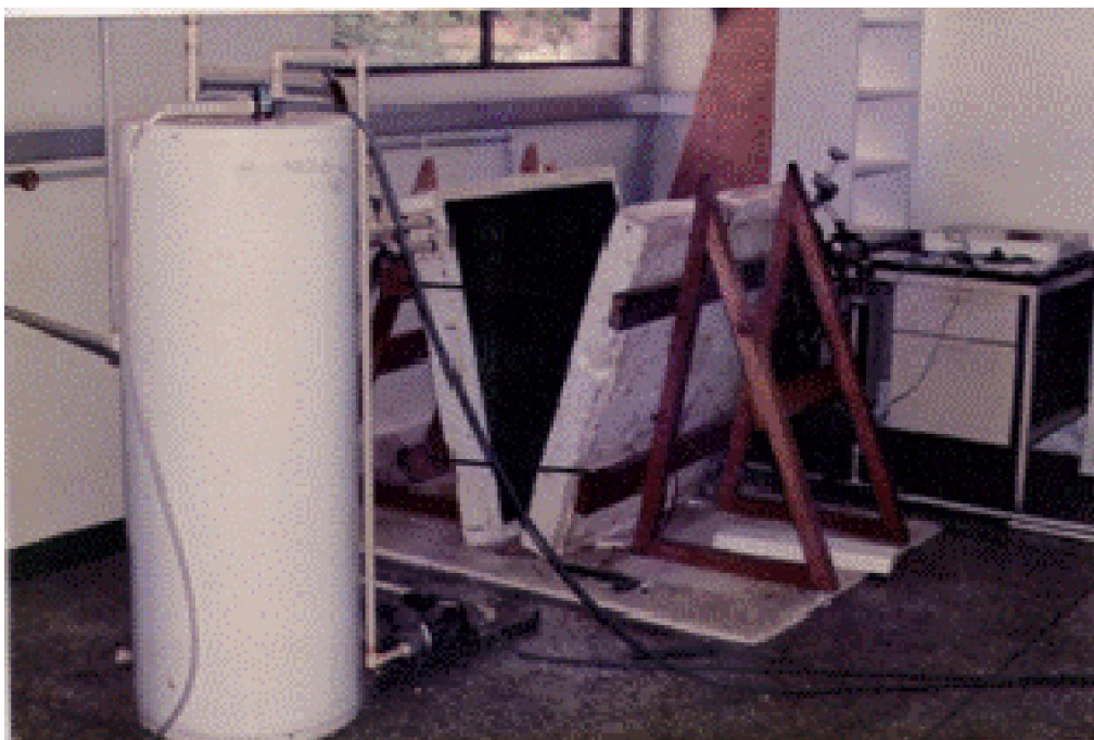
Figure 2. Steady state cold/hot plate apparatus.

SUGARCANE FIBRE: - Theoretically determined thermal conductivity contribution due to air conduction, solid conduction, radiation and apparent thermal conductivity. Plotted points (+) are the experimentally determined apparent thermal conductivity.