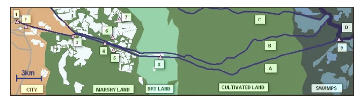
Figure 2. Sampling sites in dry weather flow (DWF) channel and the fish ponds in EKW. Sample locations: 1) Topsia, 2) Ambedkar Bridge, 3) Bantala, 4) Bamunghata, 5) Nalban, 6) Chachchria, 7) Dhalibheri, 8) Karaidanga and 9) Ghusighata. Canals and rivers: A) storm water flow (SWF), B) dry weather flow (DWF), C) Bagjola Khal (canal) and D) Kulti River.

stakeholders of the EKW (Fish Producers Association (FPA). Save Wetlands Committee (SWC). Labour Unions, etc.), supporting the sustainable livelihoods of the community without hampering ecologically balanced wetlands. The present study analyzed the impact of excess flow on the water volume of the sewage ponds based on the depth and the catchment area of the ponds, by using two neural network models. The additional sewage flow to these ponds will enhance the continued wise use of this facility. The additional sewage load in conjunction with some remedial measures to the existing channel system will potentially enhance fish production by providing additional flow (that is additional fertilizer) for the pond system. The additional sewage flow is predicted to meet WHO guidelines for wastewater-fed aquaculture and irrigation for agriculture. Discharge standards into inland waters will still be met.