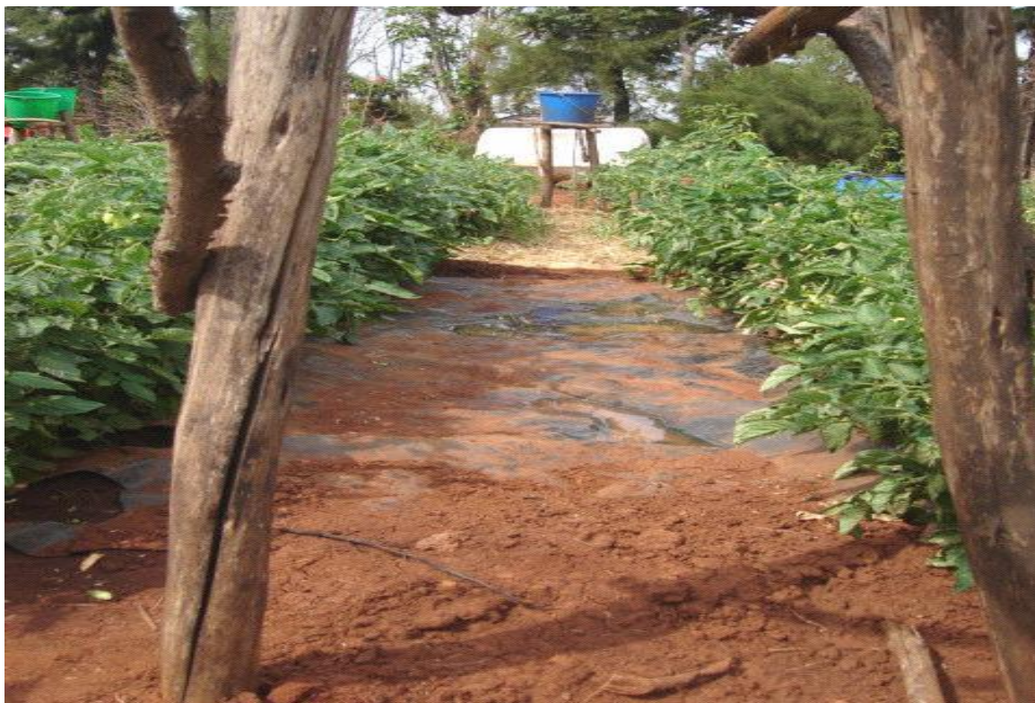
Figure 2. Chapin bucket kits drip irrigation system mounted 1 m above the ground on a stand constructed from wood.

obtained via 565 mm (WL), while the lowest marketable and total fruit yield (39.97 and 46.16 tone/ha) was recorded via 315 mm (WL) (Table 3).