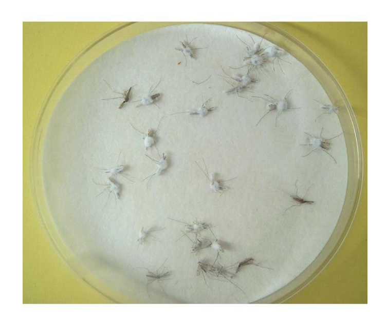
Figure 2. B. bassiana RBL1034 growing on mosquito cadavers 3 days after death following exposure to fungus impregnated target.

The main objective of malaria vector control is to break the transmission of malaria parasite. Therefore reducing the life span of the female A. gambiae will have a considerable impact on the transmission risk of the malaria parasite. Sholte et al. (2003) reported that an entomopathogenic fungus Metarrihzium anisopliae was pathogenic to both sexes of A. gambiae and Culex quinquefasciatus and mosquitoes in the treated group died significantly earlier that those in the control group. Similarly, in the