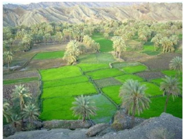
Figure 3. Landscape of Bahukalat River (in the Bahukalat (Gando) protected Area)