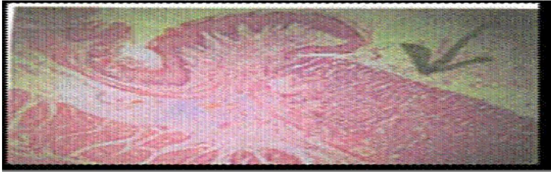
Figure 1. Photomicrograph showing gastric mucosa with mild atrophy (HE X 40).