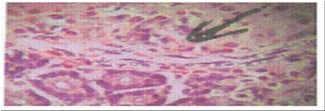
Figure 3. High power of the mucosa and submucosa showing eosinophils and lymphoplasm cells HE X 100).

posed that non-prostanoids protects gastric mucosa through the mobilization of endogenous prostaglandins (Konturek et al., 1987). Misoprostol a synthetic analogue of prostaglandin E 1 completely protected the mucosal layer against piroxicam-induced lceration. Histopathologi-