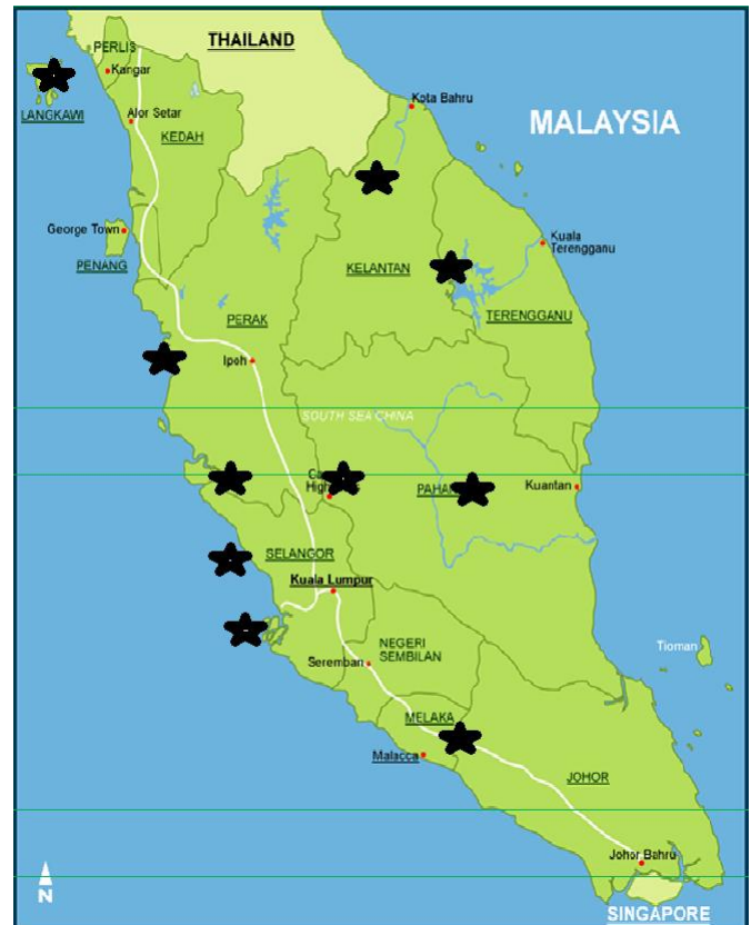
Figure 1. Outline map of Peninsular Malaysia showing the locations of samplings performed in the present work.

According to our observations and discussion with Citrus growers in Malaysia, the Citrus trees are propagated by air layering method in this country. There were some reports on occurrences of CTV in Peninsular Malaysia that needs attention, as information on CTV in Malaysia is limited; hence, this research was carried out to determine the distribution and host range of CTV in