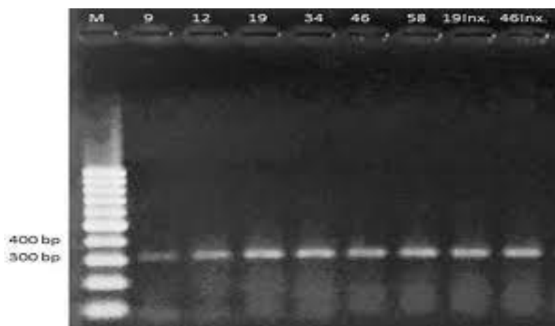
Figure 2. PCR product profile of some Malaysian Citrus tristeza virus isolates in 1.2% agarose gel. M, molecular marker; line 1 to 17, infected plants; line 18, healthy plant.