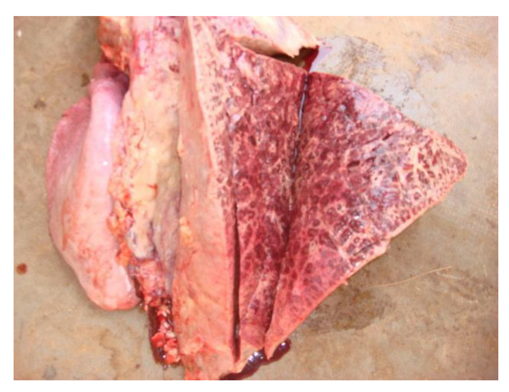
Figure 4. Acute gross lung lesions of CBPP in an untreated animal (I4). On cross-section, the surface of the lung exuded large amount of serous fluid and showed a pronounced interlobular thickening with a marbled appearance.