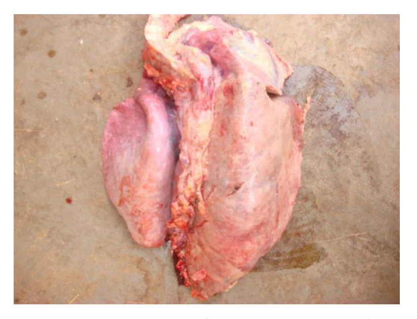
Figure 3. Acute gross lung lesions of CBPP in an untreated animal (14). Note the volume and the consolidation of the left lung.

clinical signs of the disease for a long period of time (approximately 4 - 5 months) and recovered thereafter. When they were slaughtered at the end of experimentation, chronic lesions were observed in all of them. In the intubated group, 8 had visible lung sequestra (16, 17, 19, 110, 111, 114, 119 and 120) and 2 had pleural adhesions and cicatrical lesions, indicative of resolved lung lesions (113 and 117). Among the contact-exposed