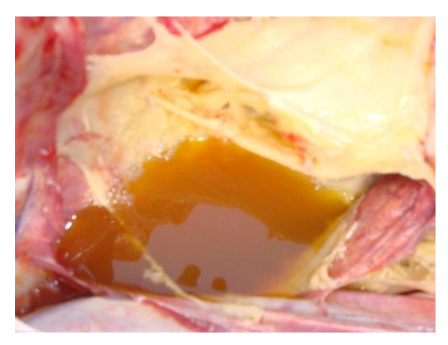
Figure 2. Acute gross lung lesions of CBPP in an untreated animal ( C 6). The thorax has been opened and an abundant quantity of clear yellow fluid (pleural liquid) is visible in the cavity.