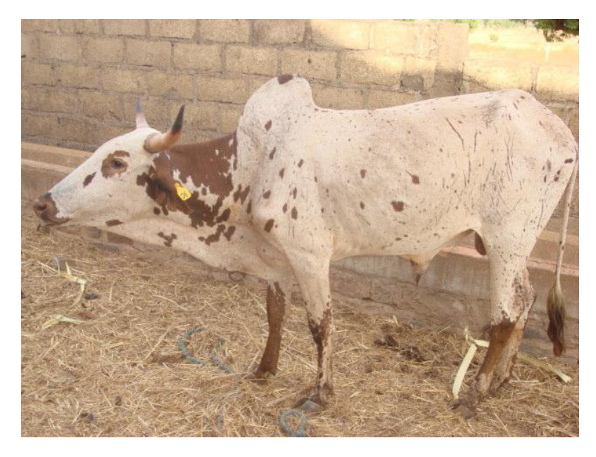
Figure 1. Acute clinical form of CBPP observed in an untreated animal (I 4) one month after intubation. Note the neck extension of the animal indicating a respiratory distress. Saliva is leaking from the mouth.

A (Lung adherence); S (Sequestrum); CL (Cicatrical lesions); B (Bronchoalveolar lavage fluid); NA (Not applicable); + (Positive); - (Negative).