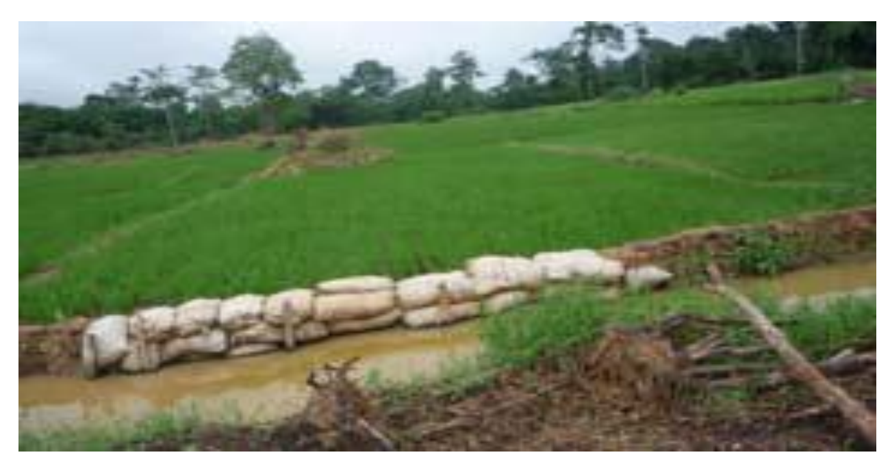
Figure 2. Sawah rice production system in the inland valleys in Nigeria and Ghana.

land. Customary land tenure systems, under which often farmers do not hold title to the land they cultivate, have been charged with failing to provide farmers with adequate incentives to adopt new technologies that could enhance production.