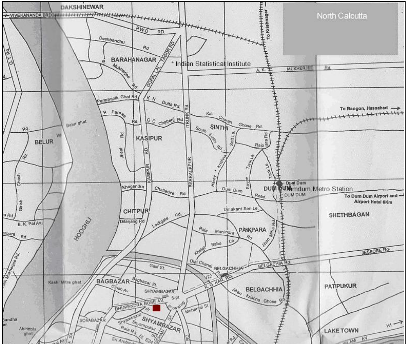
Figure 1. Sampling site of the study. Shyambazar Metro-Railway Station, Kolkata

identified up to genus level and in some cases up to species level (Cooke, 1963). The temperature and humidity data were recorded on different sampling dates (Table 1).