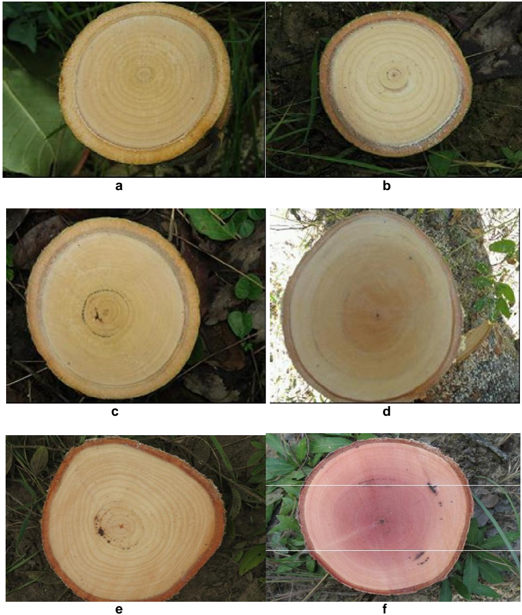
Figure 3. (a) Julbernadia paniculata (10 year old charcoal regrowth stand), (b) Brachystegia floribunda 10 year old slash and burn regrowth stand), (c) Brachystegia floribunda (16 year old slash & burn regrowth stand), (d) Brachystegia floribunda , (Mature woodland stand), (e) Isoberlinia angolensis (15+ year old slash and burn regrowth stand), (f) Isoberlinia angolensis (Mature woodland stand) Discs of Julbernadia paniculata (a), Brachystegia floribunda (b, c, d) and Isoberlinia angolensis (e, f) from different stands.

constant removal of seedlings or sprouts observed during the cultivation period as they are considered as weeds. Additionally, delayed stem development due to shoot die-back resulting from frequent fires as slash and burn sites normally have higher incidences of fires (Boaler and Sciwale, 1966) may also contribute to discrepancies between stand age and the number of growth rings. The discrepancy may also be attributed to delay germination as most plants in slash and burn regrowth stands developed from seed (Syampungani, 2008).