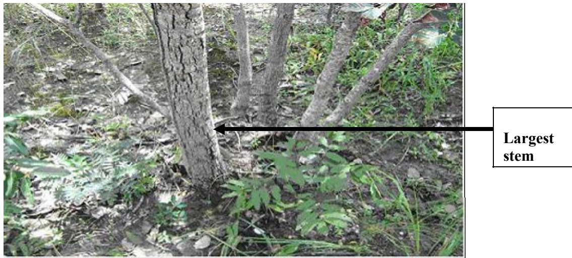
Figure 2. I. angolensis multiple stems in a ten year abandoned slash and burn regrowth stand.

These points were used to scale the software during data analysis.