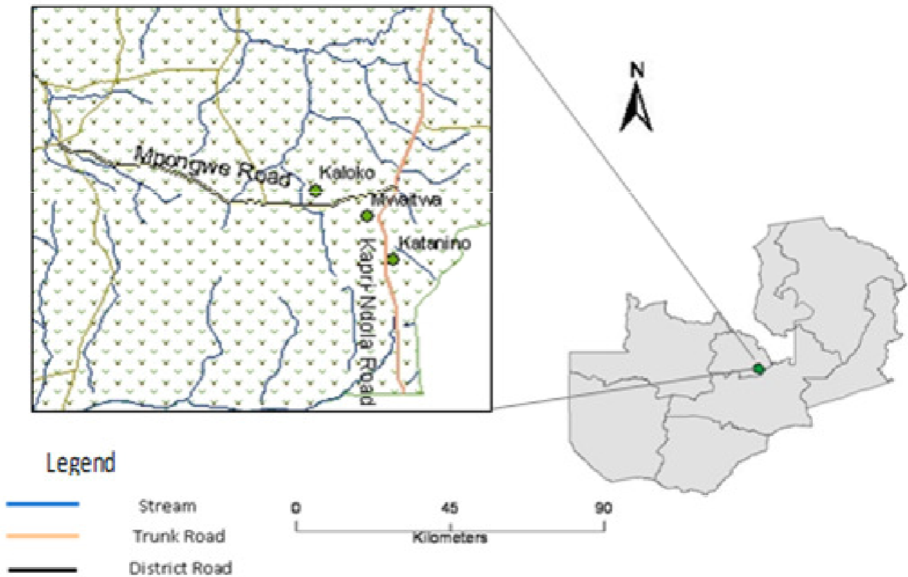
Figure 1. Map of Zambia showing study area in Masaiti District, Copperbelt Province.