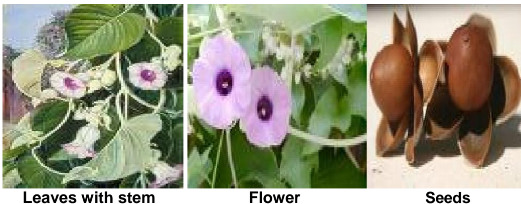
Figure 1. Leaves, flower and seed part of A. speciosa .

tion (The Wealth of India: Raw materials, 2004). Seeds of A. nervosa found to possess hypotension, spasmolytic (Agarwal and Rastogi 1974a) and anti-inflammatory activity (Gokhale et al., 2002). Chemical analysis revealed the presence of triterpenoids, flavanoids, steroids and lipids (Srivatasav et al., 1998). Roots of A. nervosa proved the immunomodulatory activity against the myelo-suppressive effects induced by Cyclophosphamide (Gokhale et al., 2003). 24R-ergost-5-en-11-oxo-3 beta-ol alpha -D glucopyranoside xylose was isolated from seeds of A. nervosa known as Argyreioside (Rahman et al., 2003).