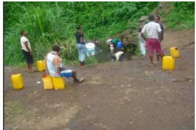
Figure 2. Exposed drinking source (Bonduma).

(c) Suggest a framework for participatory multi-stakeholder source water protection at the local level.