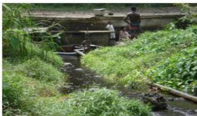
Figure 3. Level of source water protection (Small Soppo).