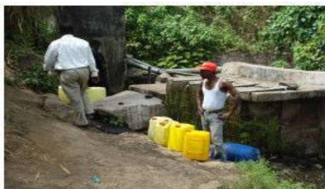
Figure 4. Level of source water protection (Koke water).

the media and land/property owners around the water sources. Notes were taken during the interviews which were also digitally recorded for further consultation.