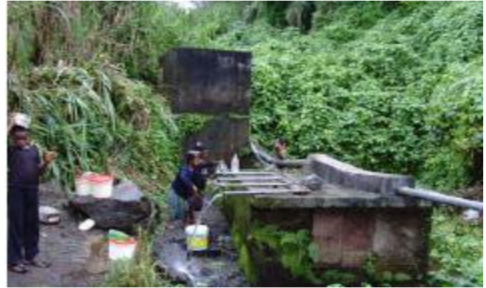
Figure 1. Community water supply scheme (Koke).