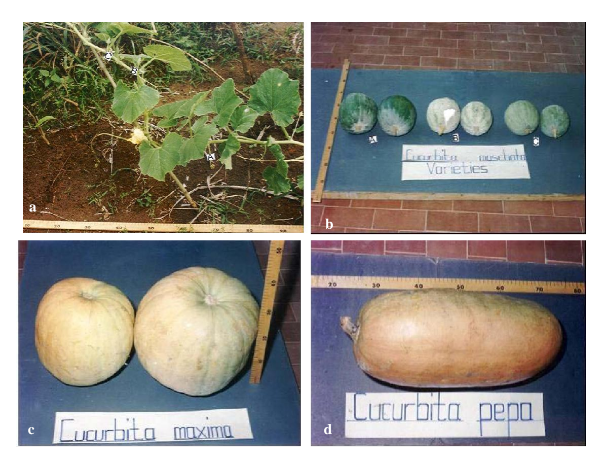
Figure 1(a-d). Characteristic features of habit and fruits Cucurbita species studied. a-habit of Cucurbita species showing severally coiled tendrils represented with letter 'a'; b- three fruit varieties of C. moschata. ; these varietal forms are occasionally produced by one plant; c-fruit of C. maxima ; fruit stalk is deeply depressed into the fruit forming a globose invagination; d- fruit of C. pepo ; fruit stalk is round, neither depressed nor sunken into the fruit.

anatomy will also provide a guide and basis for studies leading to further exploitation of these important vegetable species.