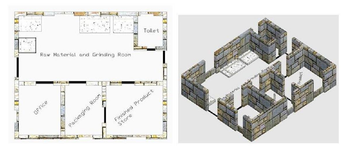
Figure 1: 4 rooms and a toilet building for a small scale Tomato Processing centre

Note: The cost of water was excluded and without the building cost, the total cost estimate will be №1, 367,500. The estimate in the table above is a rough estimate.