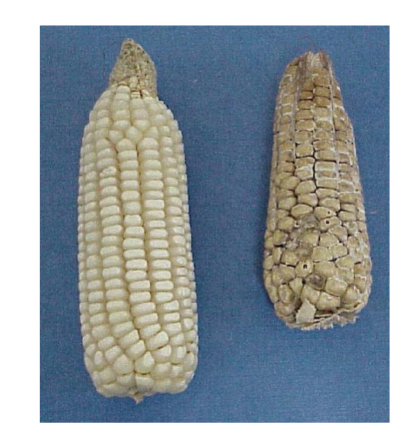
Figure 1. Apparently healthy maize cob (left) and Fusarium -infected maize cob (right).