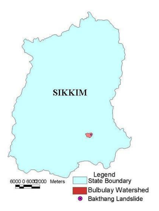
Figure 1. Location map of Bakthang landslide.

positioning system with a wide set of applications. By tracking the electromagnetic waves that are sent continuously to the earth, the system can obtain the 3D coordinates ( \Phi , \lambda , h or x, y, z). The results are discontinuous over time, and related to the cumulative movements of the surface point. The accuracy required for the measurement of landslide displacement should be many cases, at least in the order of centimeters (Josep et. al., 2000). Measurement of landslide displacement can be undertaken by means of either static or Kinematic method. The choice depends on the practical considerations: