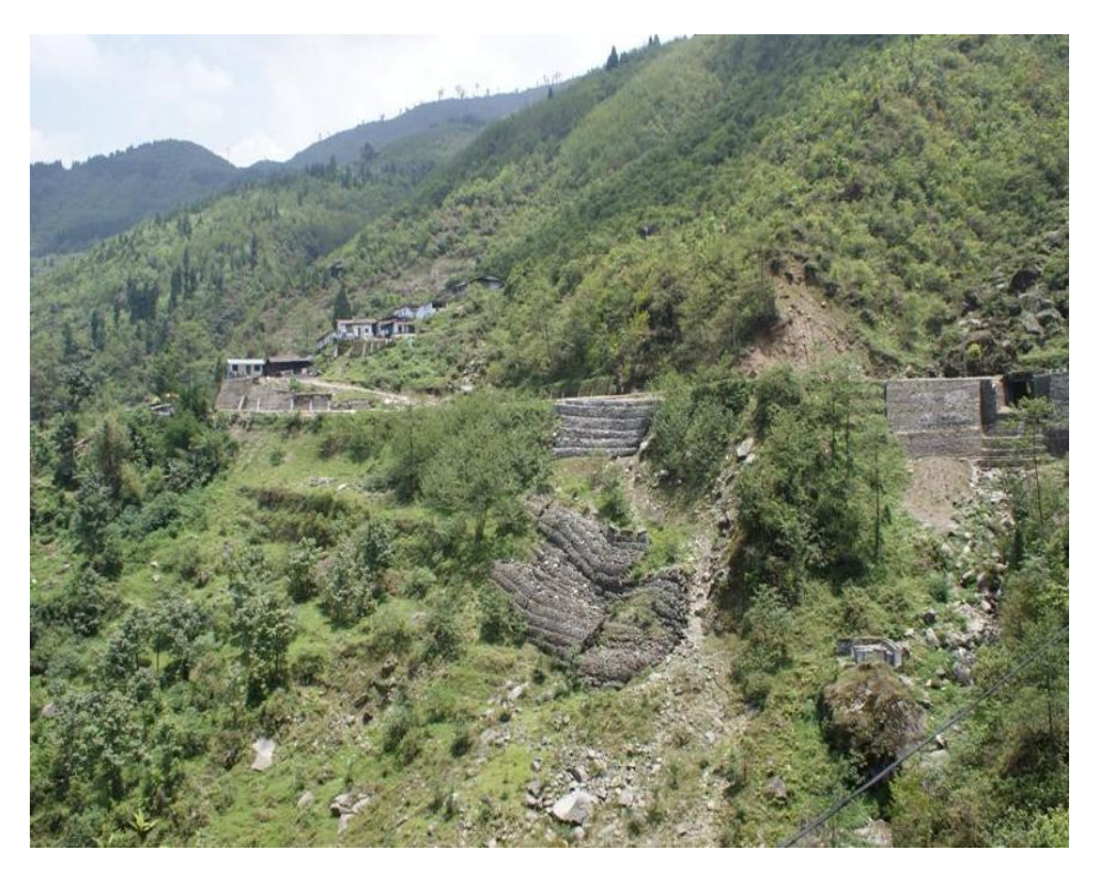
Figure 2. Bakthang falls landslide.