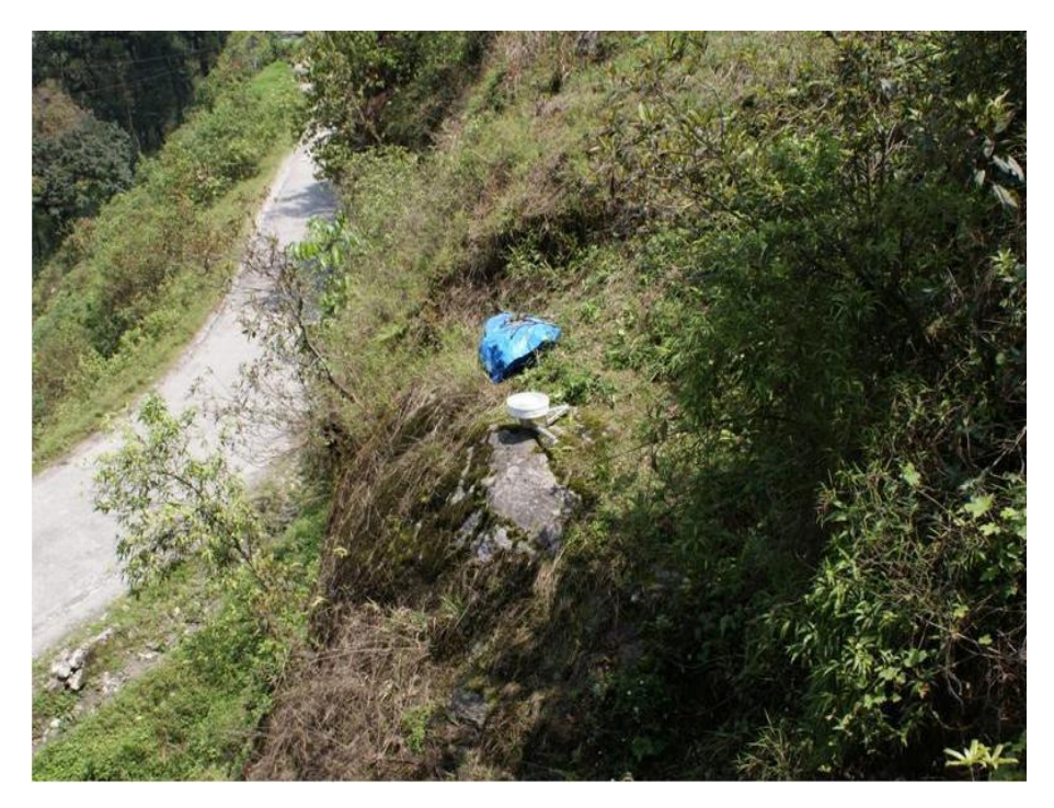
Figure 4. GPS Reference station in Bakthang slide.