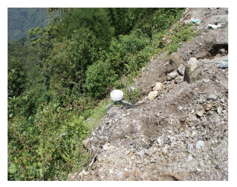
Figure 5. GPS Campaign site in Bakthang slide.

were carried out in post-processed mode using Lieca 1220 Geo-Office software while the GPS kinematic data were processed in real time mode. Data generated through the help of Geo- Office and GAMIT/Globk software.